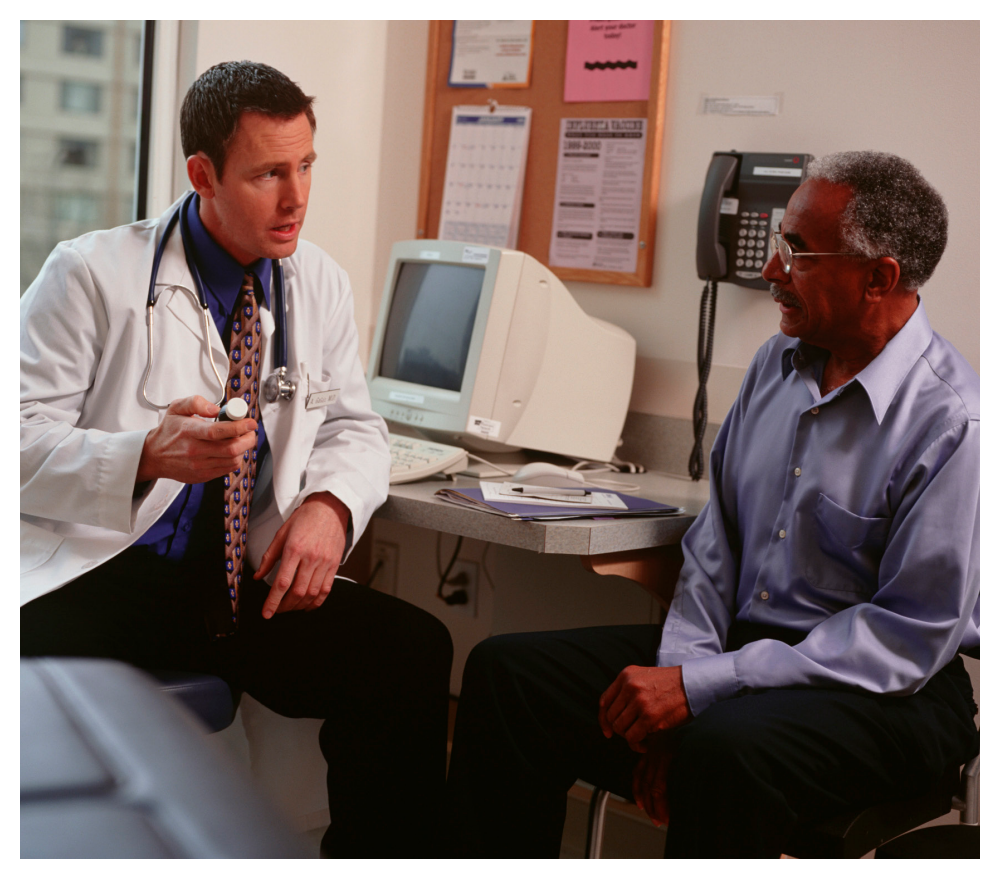
Some medicines can help treat the symptoms of Alzheimer's disease.

There are medicines that can treat the symptoms of Alzheimer's disease. But, there is no cure. Most of these medicines work best for people in the early or middle stages of the disease. For example, they can keep your memory loss from getting worse for a time. Other medicines may help if you have trouble sleeping, or are worried and depressed. All these medicines may have side effects and may not work for everyone.